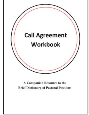
Order from uccresources.com

At the end of the designated-term, a church might create a Search Committee to prepare for the search of a settled pastor. Whether or not the designated-term pastor is considered as a candidate for a settled position depends upon the original terms of the designated-term call agreement. See the Call Agreement Workbook for examples.