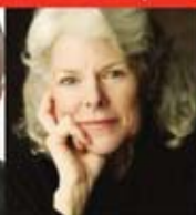
Barbara Brown Taylor