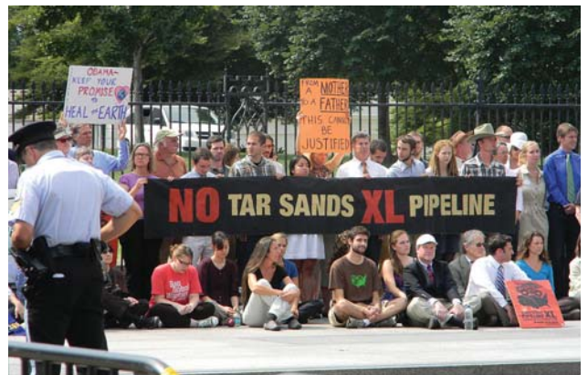
Environmental justice rally, Washington, DC