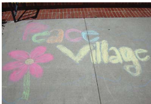
Peace Village summer peace camp

“A Just Peace is grounded in the community of reconciliation: the Just Peace Church. Jesus, who is our peace (Ephesians 2:14), performed signs of forgiveness and healing and made manifest that God’s reign is for those who are in need. The church is a continuation of that servant manifestation. As a Just Peace Church, we embody a Christ fully engaged in human events. The church is thus a real countervailing power to those forces that divide, that perpetuate human enmity and injustice, and that destroy.”