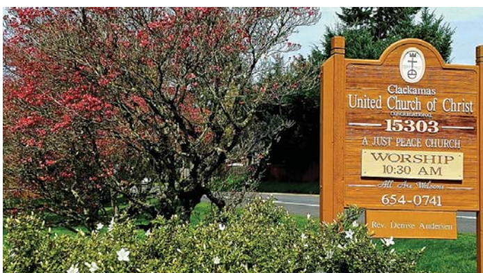
Clackamas UCC, Milwaukie, OR