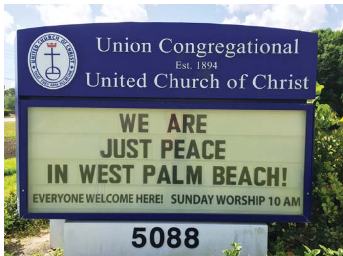
Union Congregational UCC, West Palm Beach, FL

Prayerfully, Union's spiritual grounding towards becoming a Just Peace church offers yet another tool of reflection on how other congregations might ignite a new or renewing covenantal relationship of being Centers of Just Peace alongside all of God's people in our world today.