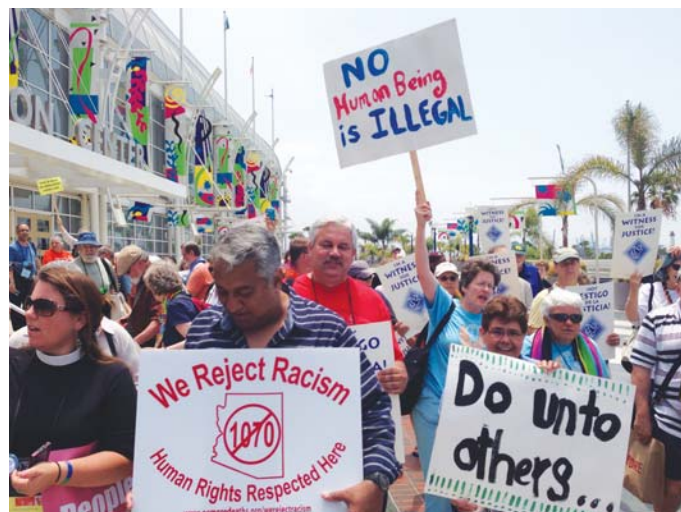
Immigration Rally at General Synod 29 in Long Beach, CA.